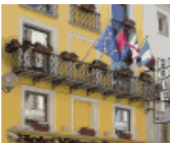
Hotel Vittorio Emanuele 3**** Corso Vittorio Emanuele 100-102 07100 Sassari

Tel: 079/235538 www.hotelvittorioemanuele.ss.it