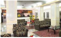
Hotel Grazia Deledda 4**** Viale Dante, 47 07100 Sassari

tel: 079/271235; www.hotelgraziadeledda.it