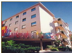
Hotel Leonardo da Vinci 3**** Via Roma, 79 07100 Sassari

Tel: 079/280744; www.leonardodavincihotel.it